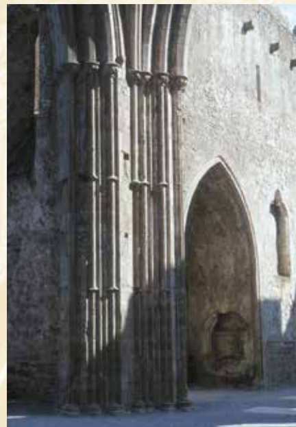
Pier of the crossing and transept chapel, the Cathedral