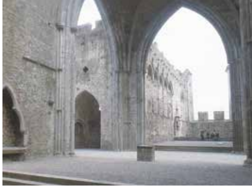
The Cathedral nave and choir

The Cathedral The cathedral is a large cruciform Gothic church without aisles built between 1230 and 1270. A 15th-century tower rises from the crossing between the church and the transepts. The cathedral was crudely fitted in between three earlier features: the round tower, Cormac's Chapel and a rock-cut well. An extensive and varied collection of stone heads was used on capitals, label stops and corbels both inside and outside the building.