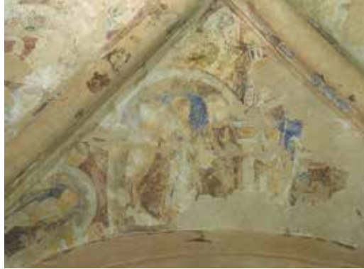
12th-century painting on the chancel ceiling of Cormac's Chapel

The chancel is almost square in plan with an externally projecting altar recess at its east end. A puzzling feature of the chapel is that the chancel is positioned off-centre to the nave. The chancel arch, of four orders, has finely carved pillars and capitals. The second order from the outside has a remarkable series