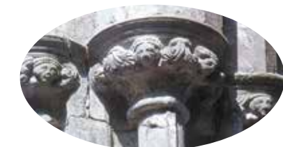
Right: Carved heads on 13th-century capitals

Cashel would have had a relatively large church or cathedral soon after 1101 and certainly by 1111. This probably stood on the site of the east end of the 13th-century cathedral choir. In 1119 a