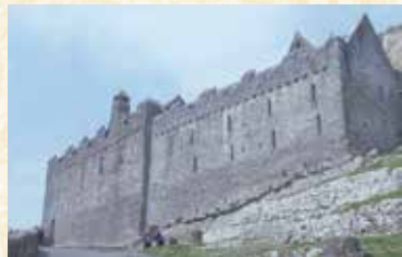
Right: The hall and dormitory of the Vicars Choral from the south Background: Choir windows of the Cathedral

The upper level comprised the main living room of the Vicars Choral with a large fireplace in its south wall. This room has been restored with a timber gallery at its west end. The vaulted undercroft beneath the hall contains a collection of stone sculpture mostly from the Rock. The original St Patrick's Cross is housed here to protect it from weather damage.