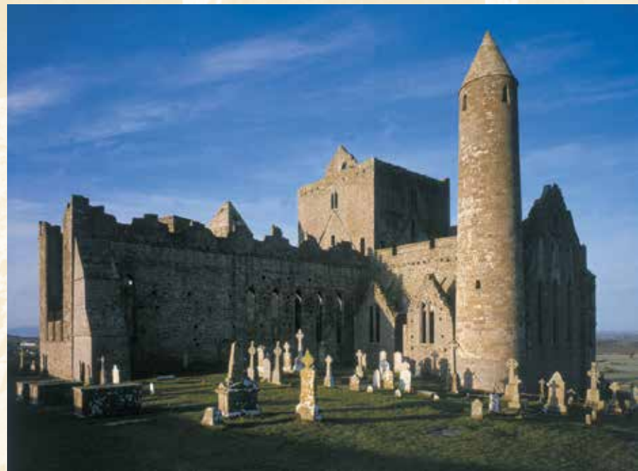
Above: The Round Tower and Cathedral from the north east Background: Choir windows of the Cathedral