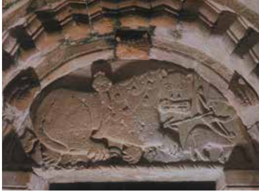
Tympanum over the north doorway of Cormac's Chapel

The south door is not as impressive as the larger, more ornate original main entrance doorway on the north side of the building. The carved tympanum above this north door shows a large lion being hunted by a small centaur (half man, half horse) with a bow