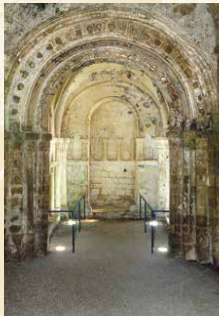
Interior of Cormac's Chapel