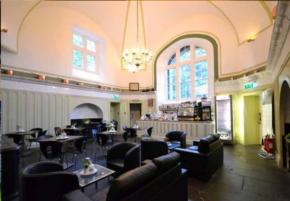
Clockwise from top left: Dublin Castle; Kilkenny Castle; Castletown House and Parklands; Farmleigh House