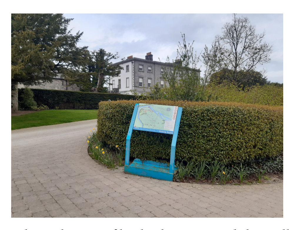
Turning right at the top of both, the steps and the walkway will bring us to the Visitor Centre