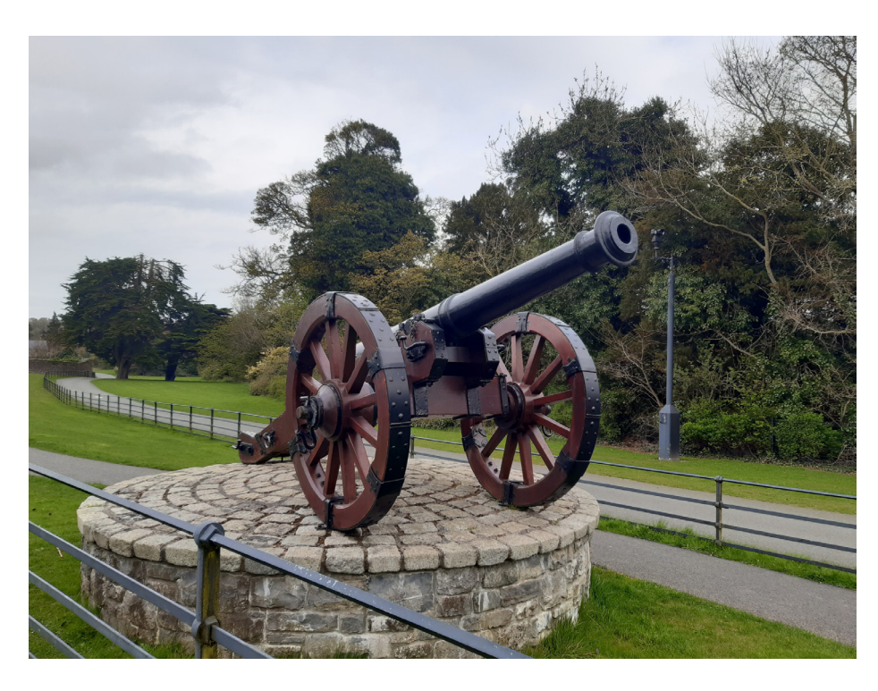
Entering through the gates we will first see a cannon to welcome us to the Battle of the Boyne