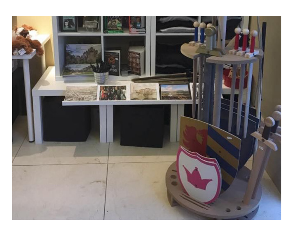
And a Gift Shop too, if we would like to buy a souvenir

There is a Tea Room for snacks or lunch in case we are hungry