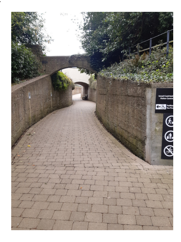
or By walkway