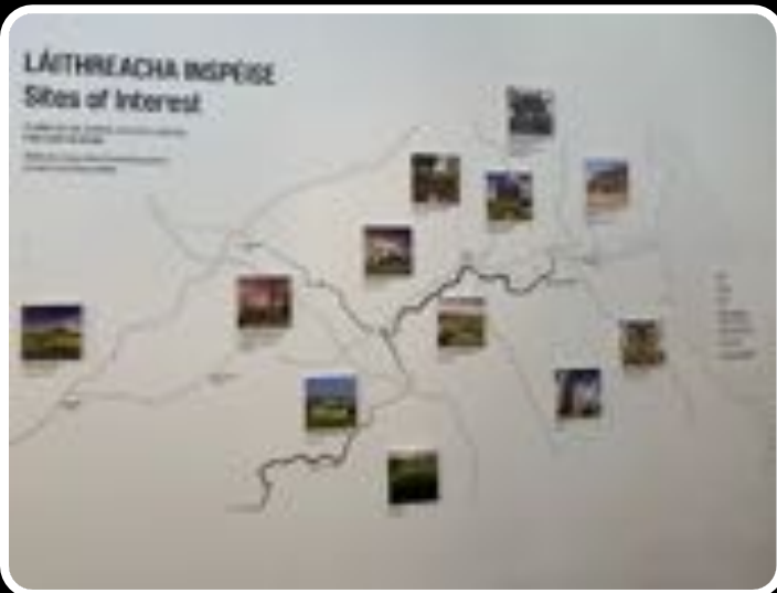
A Boyne Valley sites of interest map and film