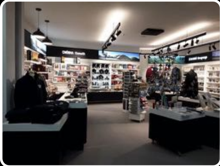
A Gift Shop