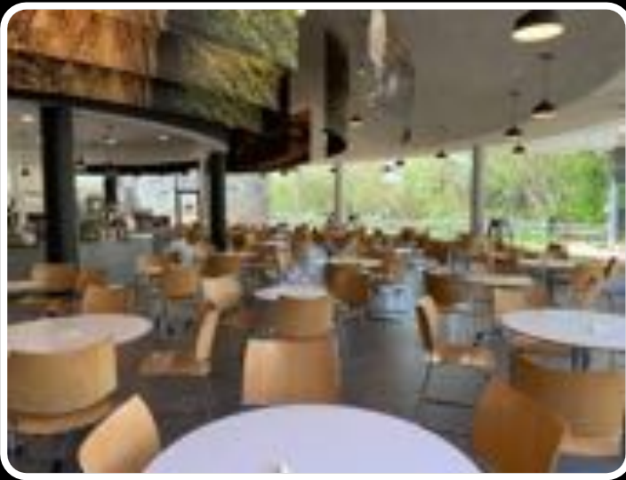
Downstairs in the Visitor Centre There is a café