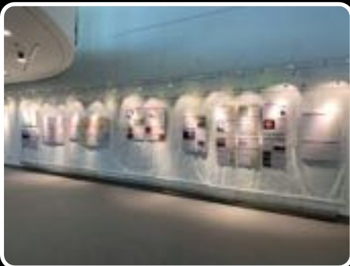
A temporary exhibition area