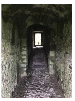
Sally Port -Tunnel