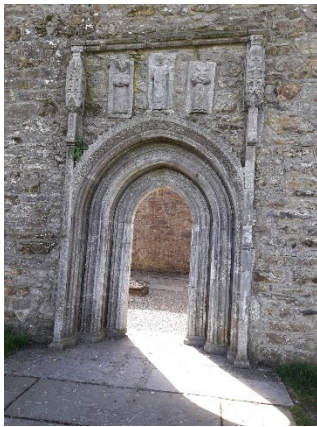
The whispering arch