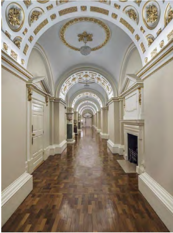
The State Corridor