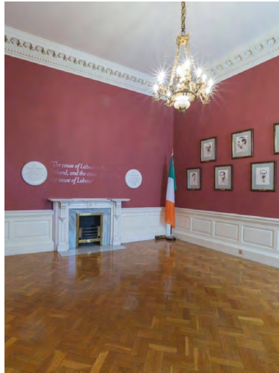
The James Connolly Room