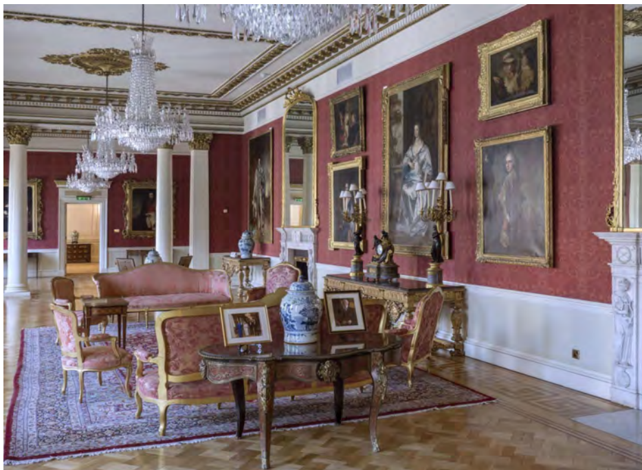
The Drawing Room