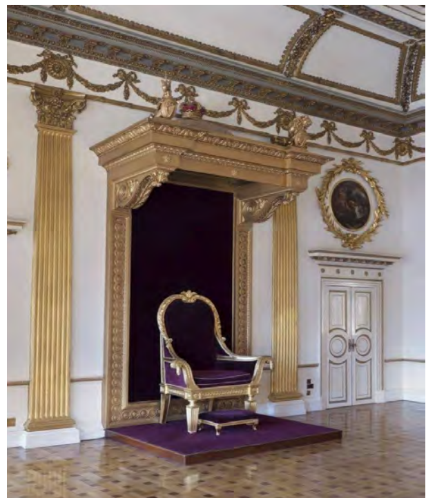
The Throne Room