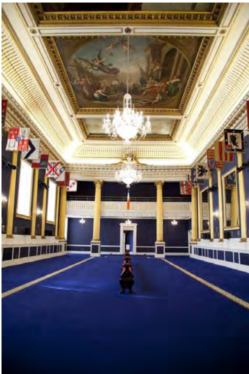
St. Patrick's Hall