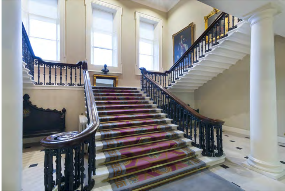
The Grand Staircase

We can walk around these rooms guided with a group or by ourselves with an information booklet. We can take as many photos as we'd like except for flash photography and video recording. We can access the rooms upstairs by the grand staircase or we can ask a staff member to take us to the lift.