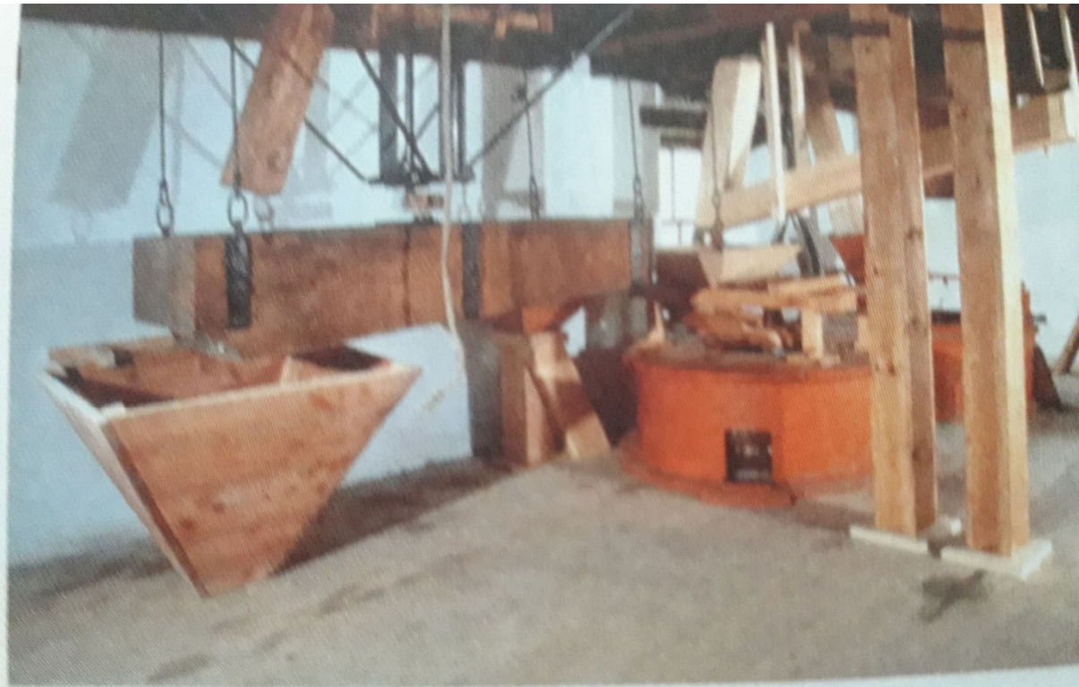
The milling floor of the Corn Mill

THE STONES USED TO GRIND THE CORN HAD TO BE MAINTAINED AND YOU CAN SEE THIS BEING DONE FROM THE PHOTOGRAPH. THIS PROCESS WAS CALLED DRESSING. LOOK OUT FOR THESE STONES ON YOUR VISIT