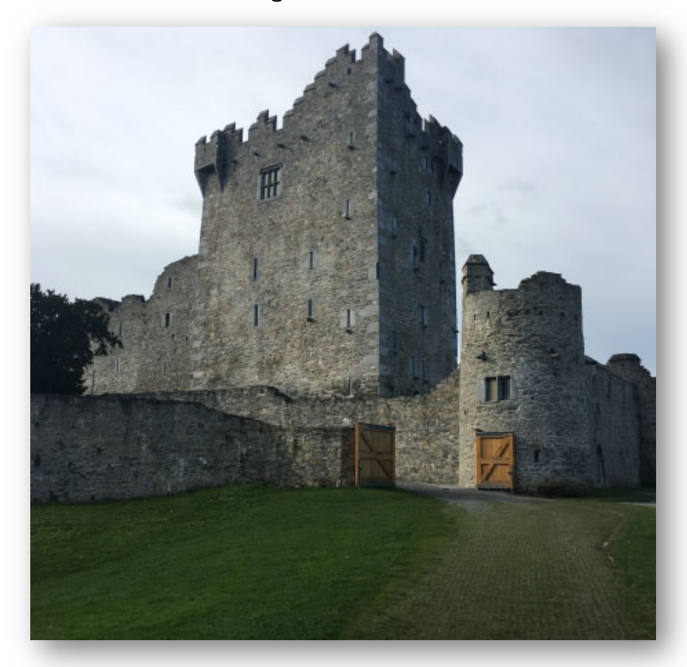
This is the entrance to the courtyard.