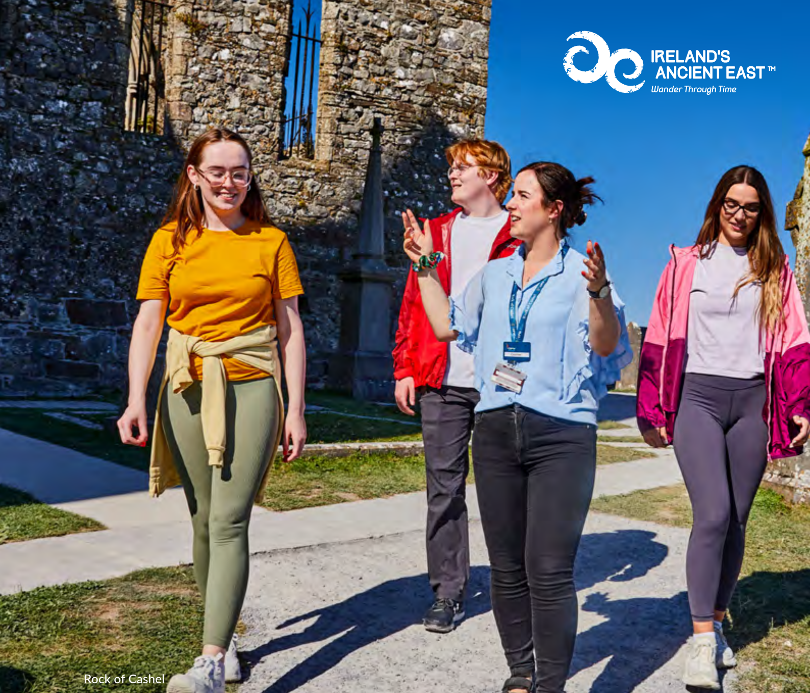
Rock of Cashel