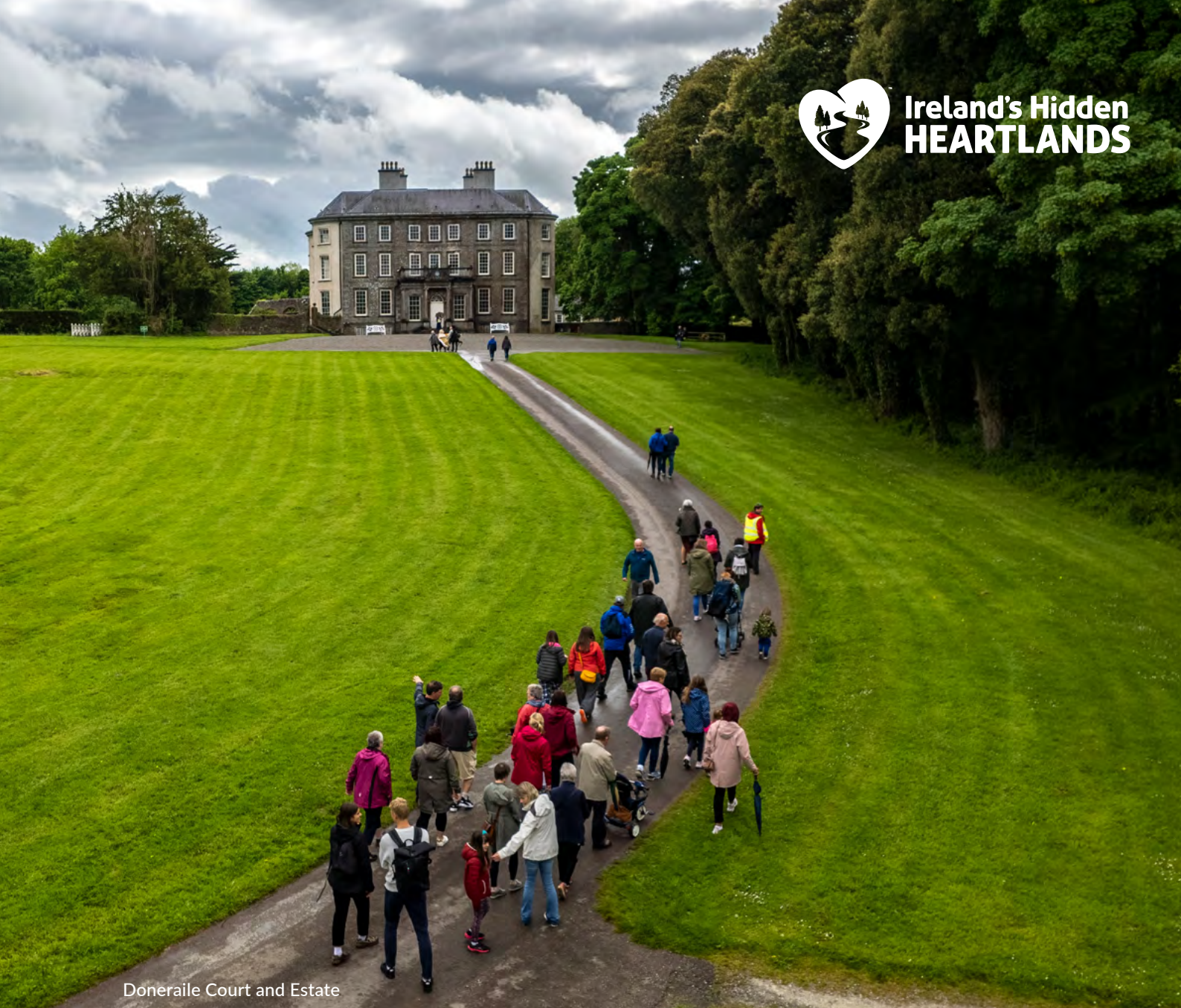
Doneraile Court and Estate