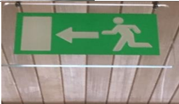
This sign tells me where the exit is