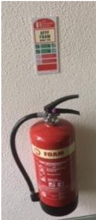
This is a Fire Extinguishing point