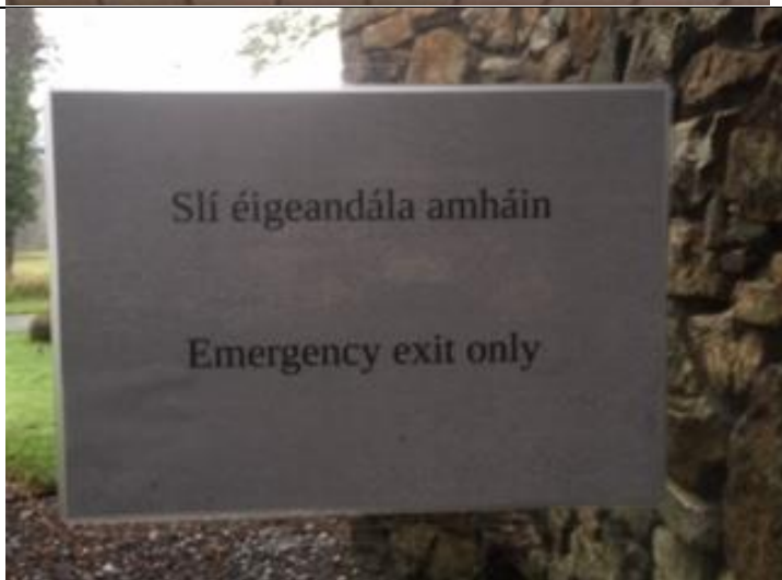
This sign tells me that I can leave through this door if there is an emergency