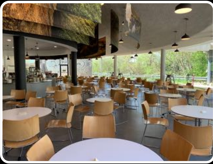
Downstairs in the Visitor Centre There is a café