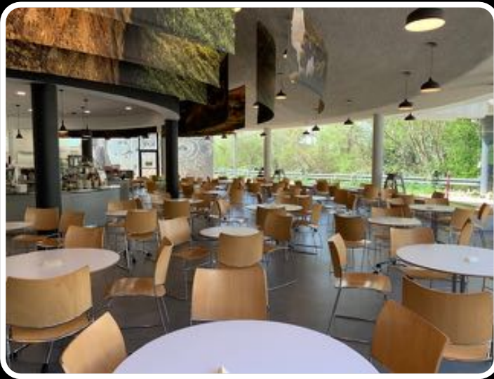
Downstairs in the Visitor Centre There is a café