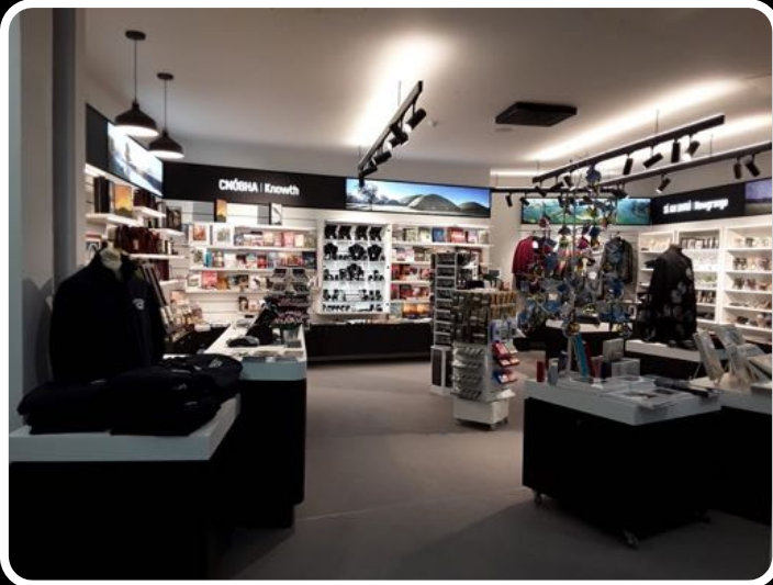
A Gift Shop