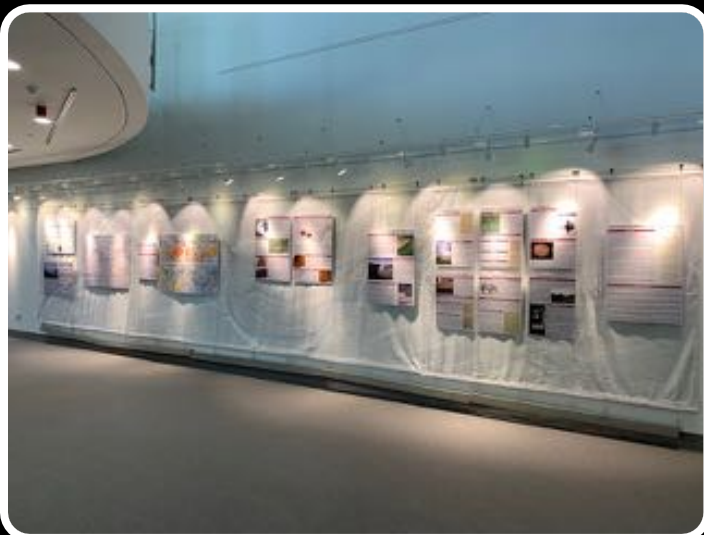
A temporary exhibition area