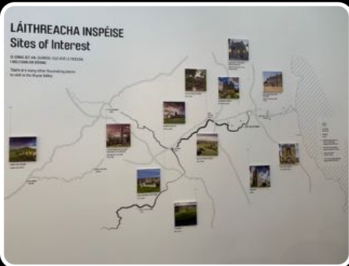
A Boyne Valley sites of interest map and film